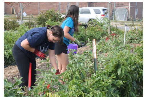
Students weed garden beds at Raleigh City Farm on Community Work Day in October 2022.