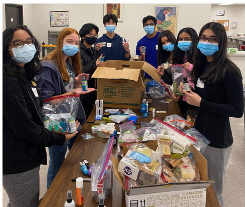
Top: Students explore 19th century history in Durham County as part of the 11th grade Slavery and the Civil War Flex Day. Bottom: Students create care packages on Community Work Day at Oak City Cares.